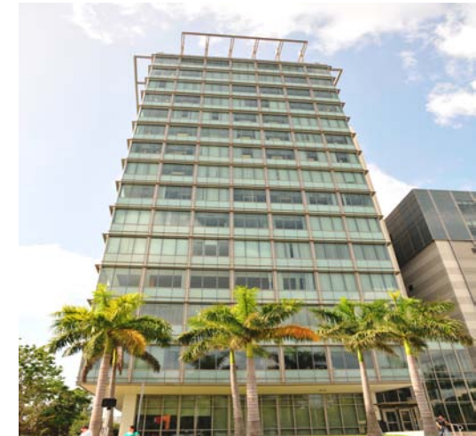
RSAP Location: Clinical Research Building 1120 NW 14 Street, Ste 971 Miami, FL 33136

RSAP is dedicated to providing a quality research experience, and facilitating qualified and available mentors along with RSAP staff, to increase the possibility for success of our residents.